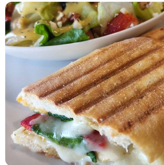
Pesto Chicken Panini

Golden fries topped with seasoned ground beef, sautéed onions, shredded cheese blend and topped with peas.