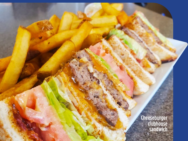
Cheeseburger clubhouse sandwich