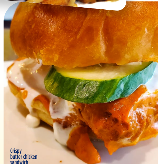
Crispy butter chicken sandwich